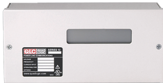
3.75" H x 8.25"W x 3"D