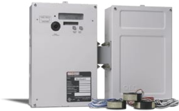
Dimensions (each box): 13.5"H x 8.5"W x 4.5"D

The MiniCloset-5 (MC-5) is an accurate and reliable multi-tenant digital electric meter that is easy to install and operate. This compact commercial meter monitors up to eight three phase loads in a fraction of the space used by socket meter banks and is an ideal solution for retrofit projects. It provides interval and TOU data as well as real-time power diagnostics by phase. All metering data are securely stored in a non-volatile flash memory.